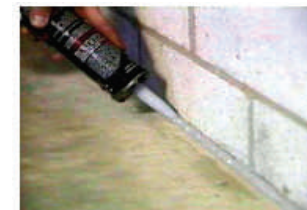
First! Find and Fix Air Leaks!

We can make suggestions from an observer's point of view only. For example, if you have older single-pane windows and your insulation isn't very good, perhaps it's time for an upgrade. This is something you can determine yourself by performing your own energy audit with the help of our website ( www.eea.coop ) and click on the Home Energy Suite tab. Also under the Library Tab, you'll discover a Home Energy guide that will take you through each room of your home. You can then make a list of things you may need to change or upgrade.